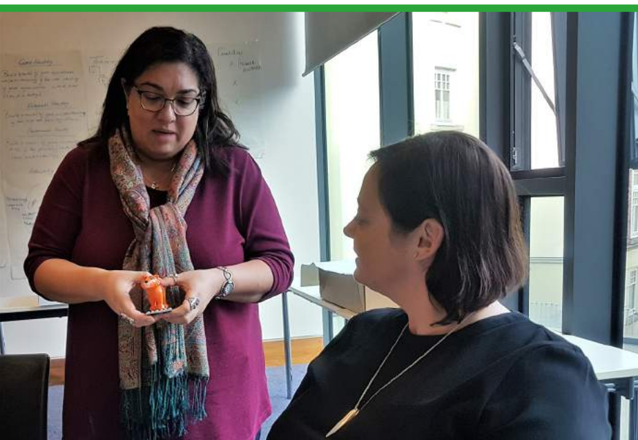
AFSHAN IN A TRAINING SESSION

The model you see in my profile pic was built for this article. The skeleton is me; I grow different skins to fit my various projects, on my head, I have a knowledge tree. One day, I can be working World Bank or British Council designing education quality standards for different governments. The next day, I could be using LSP, developing teams and vision for businesses such as Dyson. The grey plate is my Transformation Space, the area of my business which holds LSP. The flag marks success and the duck is very special. This duck has wings, as I work internationally, but more importantly, to me, the